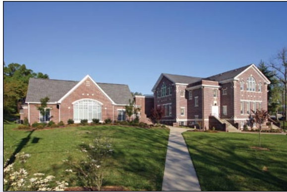
First Baptist Church - Mt Holly