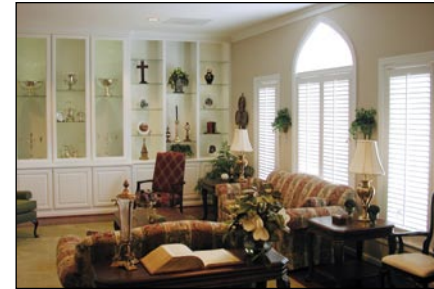
Holy Trinity Lutheran Church