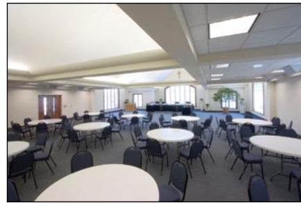
First Baptist Church - Mt Holly