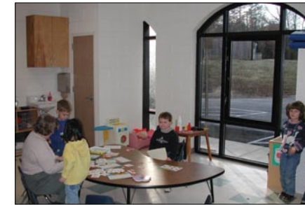
Bethesda Methodist Church