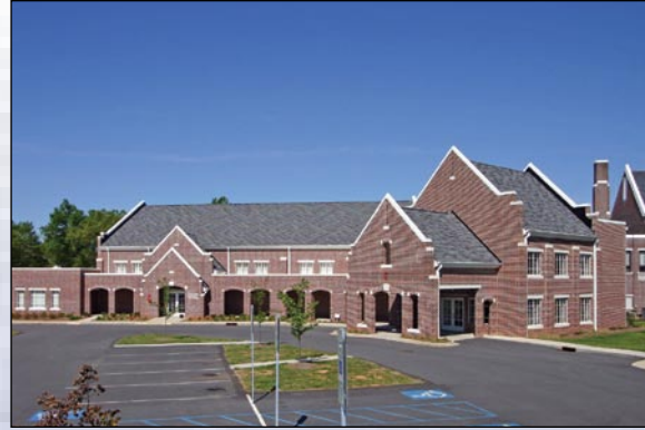
First United Methodist Church - Clover