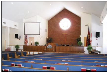
Salvation Army Center